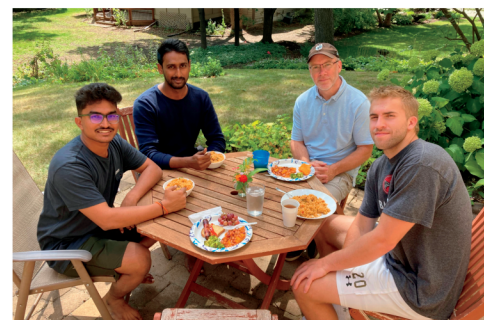
↑ Kristen’s family with Kore & Max during their stay.

*Pseudonyms have been used to protect the students’ identities.